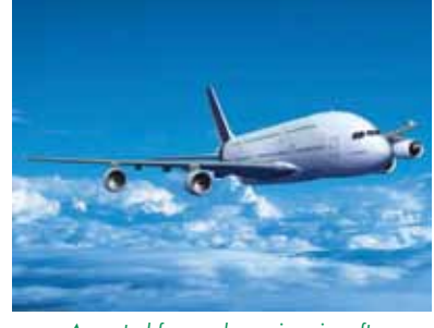
Accepted for use by major aircraft manufacturers.