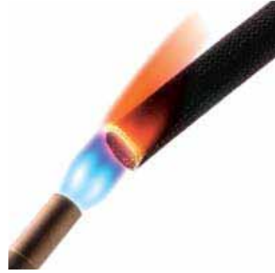
Insultherm resin saturated braided fiberglass sleeving is ideal in areas where fire and extremely high temperatures create a hazard to personnel and equipment.