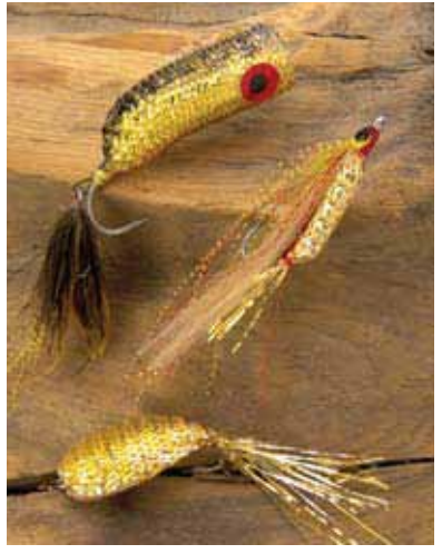
Light weight and economy make MY an ideal product for designing and tying fishing lures of all types and sizes. Several world records have been set with lures constructed with Techflex sleeving.