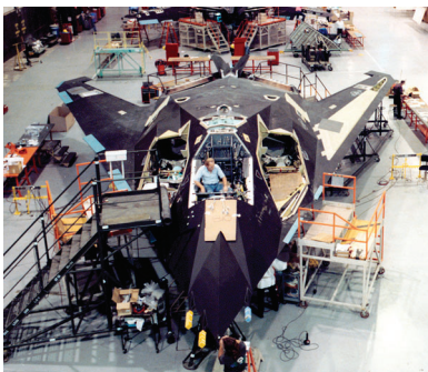
Flame resistance, strength and low weight make Ryton sleeving the first choice in high-tech aeronautic design specifications.