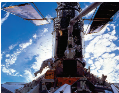
A true aerospace material, Ryton is ideal in satellite applications where weight and stability are of primary importance.